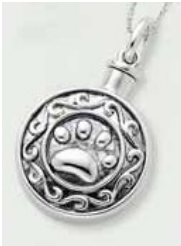
← Antiqued Paw Print Circle