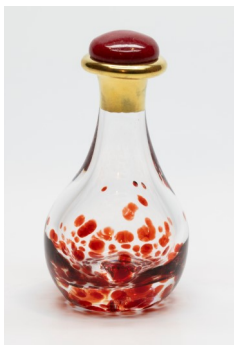
RED ITEM# 4023