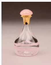
Baby Pink (Item# 4061)