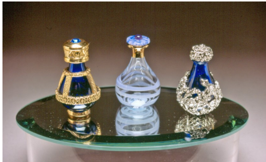
Pictured: Gold-banded Roma, Amethyst Contemporary & Silver Victorian Tear Bottles atop an Oval Mirror Riser (Item# 6829)

Let us help you serve this important market need with our exclusive, unique and made in the USA products.