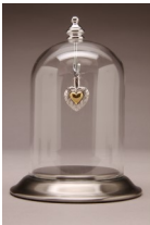
← 3"x4"H Mini-dome w/ Satin Pewter Base & Hook for displaying Keepsake Pendants