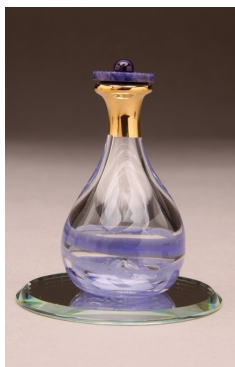
AMETHYST ITEM# 4047

The Contemporary line features a high-end selection of hand-made tear bottles. Splashes or swirls of colored glass decorate the bases. Hand-painted 24K gold luster adorns the neck of most bottles. The Blue #4009 has a navy quartz stone cap. The Red #4023 and The American (NEW!) #4177 both have a red quartz cap. The Amethyst #4047 cap is a beautiful sodalite stone topped with a petite amethyst cabochon. The Blue/Teal Swirl has a blue dyed abalone cap. All caps in this style are secured with hand-carved cork stoppers.