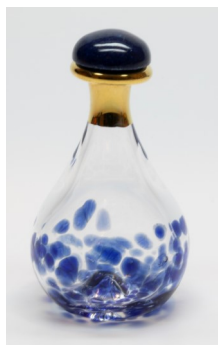
NAVY BLUE ITEM# 4009