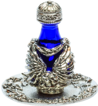
Blue/Silver Angel on silver tray Item# 3033/#6096

Includes: Tear Bottle Story Card, Organza Gift Bag and Choice of Gift Card: (1) Profound Loss Card –see pg. 23– provides wonderful imagery of seeing the angels carry tears to heaven OR (2) Angel Encouragement Card –see below—reminds those in difficult circumstances they are not alone.