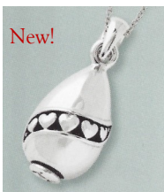
Tear with mini-Hearts # 9356