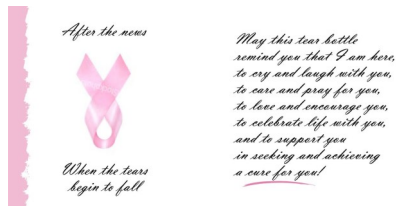
Pink Ribbon Gift Enclosure Card

Above is our hand-blown " Pink Ribbon Tear Bottle ". Created to symbolize hope, encouragement and support for those battling breast cancer, this tear bottle comes with a Pink Ribbon Gift that was designed with input from 5 breast cancer survivors!