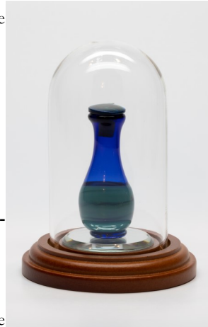
TALL MINI-DOME DISPLAY