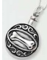
Antiqued Bone in Circle #9332

NEW! Below are featured our new MADE IN USA Pet Memorial Keepsake Bottles. These handblown bottles are opaque white glass ideal for concealing keepsakes inside. The base is black beaded “feet”. On the left is a taller slender CAT bottle with red quartz cap & “Best Friend” charm that hangs from a black collar with white paw prints. On the right is a DOG bottle with snowflake obsidian cap & paw print charm that hangs from a silver-studded black collar.