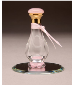
Item# 4085 Pink Ribbon Tear Bottle & Gift Card

Above is our hand-blown " Pink Ribbon Tear Bottle ". Created to symbolize hope, encouragement and support for those battling breast cancer, this tear bottle comes with a Pink Ribbon Gift that was designed with input from 5 breast cancer survivors!