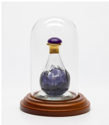
Violet Marble— Item# 4122

These hand-blown contemporary tear bottles are made by a glass artist in MT.