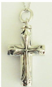
Antiqued Men's Cross—#9349