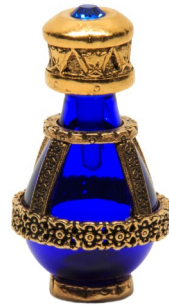
GOLD-BANDED ITEM# 1053

©2023 Timeless Traditions, Inc. All Rights Reserved