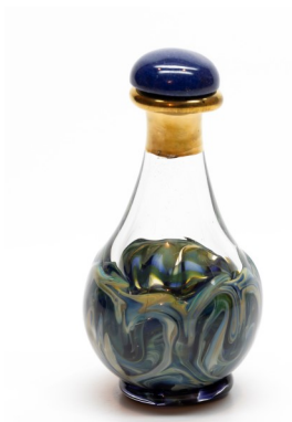
Blue Marble- Item#4108

Accented with a hand-carved cork to close the cap into the bottle and hand-painted with 24K gold luster on the rim, the swirls and layers of color are like the swirling glass in a child's marble, thus the name.