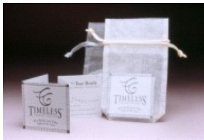
An organza gift bag & story card like those shown above come with each tear