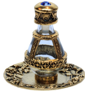
GOLD-BANDED ITEM# 1015 / 6089

Our ROMA style tear bottles look beautiful with the petite Solid-Rim Metal Trays, like the Solid-Rim Trays pictured here.