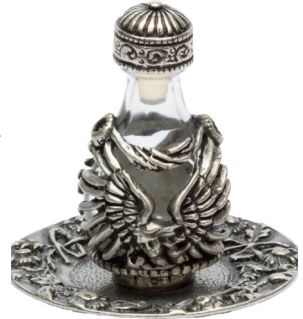
Pewter Angel on Pewter Sold Rim Tray Item# 3019/#6072

Optional Displays: Mirrors, Trays, Mini-domes are extra.