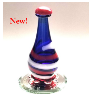
THE AMERICAN ITEM# 4177

The Contemporary line features a high-end selection of hand-made tear bottles. Splashes or swirls of colored glass decorate the bases. Hand-painted 24K gold luster adorns the neck of most bottles. The Blue #4009 has a navy quartz stone cap. The Red #4023 and The American (NEW!) #4177 both have a red quartz cap. The Amethyst #4047 cap is a beautiful sodalite stone topped with a petite amethyst cabochon. The Blue/Teal Swirl has a blue dyed abalone cap. All caps in this style are secured with hand-carved cork stoppers.