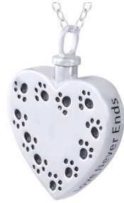
Love Never Ends - Engraved on side of pendant—#9385

See specifications for the Sterling Silver Jewelry on Pages 16 & 17. The keepsake pendants all come with a sterling silver chain and are packaged with a black velveteen bag & funnel, small plastic spoon & wooden pick to aid in inserting keepsakes (ashes, lock of hair, earth from a special place, etc.) into the pendant .