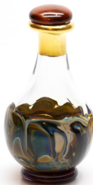
Olive Marble- Item#4115 →

These tear bottles come with the standard organza gift bag, tear bottle story card, & brochure. MADE in USA.