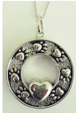
Circle of Paw Prints with Heart #9325