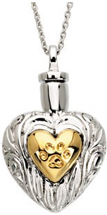
Paw Print Heart Ash Pendant—#9233

See specifications for the Sterling Silver Jewelry on Pages 16 & 17. The keepsake pendants all come with a sterling silver chain and are packaged with a black velveteen bag & funnel, small plastic spoon & wooden pick to aid in inserting keepsakes (ashes, lock of hair, earth from a special place, etc.) into the pendant .