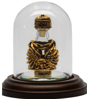
Gold Angel on small mirror inside Short Mini-dome Item# 3026/#7024/#6874

This tear bottle features the same design on opposite sides of the teardrop bottle. A serene face and a pair of grand upward sweeping angel wings on both sides with the wingtips coming together near the top of the bottle. The cap compliments the design of the bottle with its intricate pattern. Perfect as a sympathy gift (with a Profound Loss card), or a gift of encouragement (with the Angel gift card.) See card text at right.