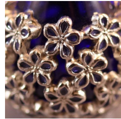
Hand-painted flowers Close-up—#3057

←Left is the “Classic” Forget-Me-Not Tear Bottle™ (Item# 3040) Featured on a Silver solid rim metal tray.