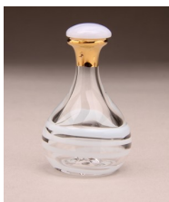
Baby Blue (Item# 4078)

Customers can also choose a "Tears of Joy" Gift card to welcome New Babies ON REQUEST