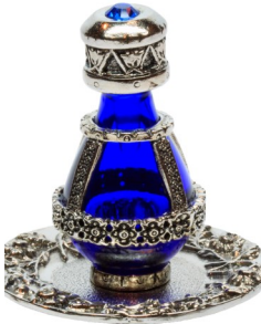
SILVER-BANDED ITEM# 1008 /6096

The Roma line features two different styles to choose from – “banded” and “forget-me-not flower basket.” The caps of all tear bottles in the Roma line are crowned by genuine blue Austrian Swarovski® crystals. Each cap has a silicon plug, providing a tight seal. The graceful, intertwining T’s of the Timeless Traditions’ logo mark appear in the filigree on the underside of each base. Height: 2”. Manufactured with Lead-Free Metals in the U.S.A.