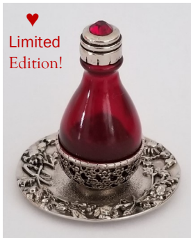
♥ Limited Edition!

New! RED/Silver Basket Roma Tear Bottle! Red is the color of Love! Christmas, Valentine’s Day, Red Hearts, Red Roses, and NOW..... Red Tear Bottles! ←